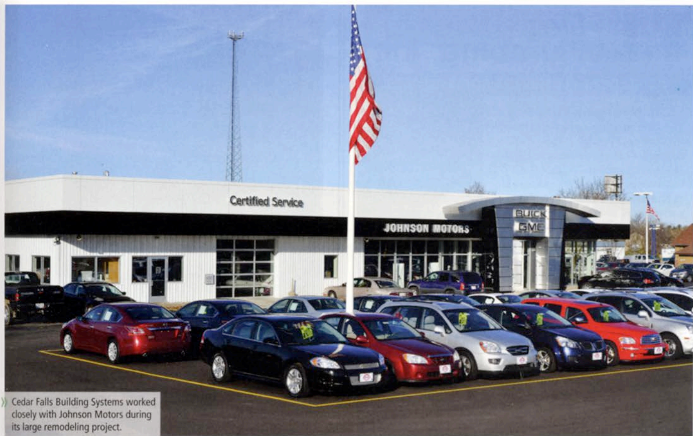
Cedar Falls Building Systems worked closely with Johnson Motors during its large remodeling project.